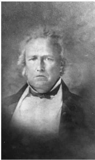
GOV. DAVID MERIWETHER New Mexico Territory’s appointed governor, 1853– 1856, and mentor to aspiring Nuevomexicanos.